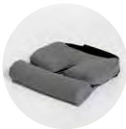
Pressure Relief Cushion available for S1 & S2

The available sizes suit children aged between 1–8 years (approx) who would benefit from extra postural support.