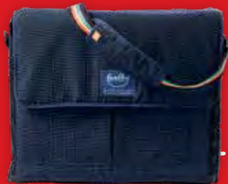
Lightweight unfolding bag/floor mat

The Playpak shoulder bag contains rolls, wedges and supports designed by our clinical experts in collaboration with therapists. These components combine in dozens of ways to facilitate three crucial early intervention postures (active sitting, supine and prone) to let children play and learn during therapy sessions or in the home.