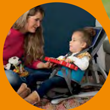
GoTo with Floorsitter

Originally designed for shopping carts in collaboration with charity Cerebra, its supportive structure and practical design also lets children sit on most standard chairs in the home, restaurants, classrooms and therapy sessions.